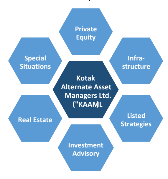
Figure 1-1: KAAML's Business Verticals

Each asset class is managed by independent teams ("Business Verticals") and each Business Vertical (BV) will also, from time to time, raise additional capital ("New Funds") from domestic and / or international investors and make investments in investee companies from such New Funds. Such New Funds may acquire majority or minority equity stakes, invest through mezzanine instruments and / or provide credit to their investee companies.